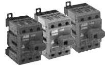
OT16F3 OT25F3 OT40F3