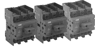
OT30F3 OT60F3 OT100F3