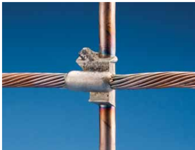
Completed GY connection