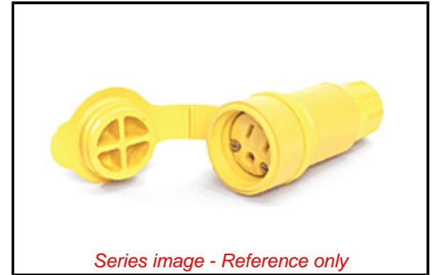
Series image - Reference only