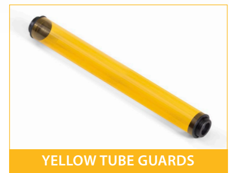
YELLOW TUBE GUARDS