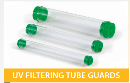
UV FILTERING TUBE GUARDS

* Note: Tested by two (2) independent light testing laboratories.