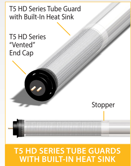
T5 HD SERIES TUBE GUARDS WITH BUILT-IN HEAT SINK

Simply insert the lamp into the T5 HD Series Tube Guard, insert the “vented” end cap on each end of the tube guard and install the “tubed” lamp into the luminaire.