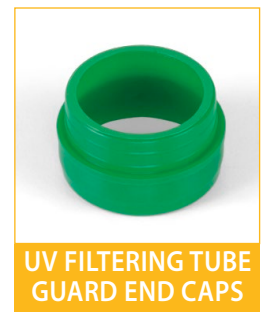
UV FILTERING TUBE GUARD END CAPS

Note: End Caps for T5, T8 and T12 Tube Guards fit inside the Tube Guard.