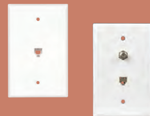
Mid-Size Wallplates with Connectors D-13