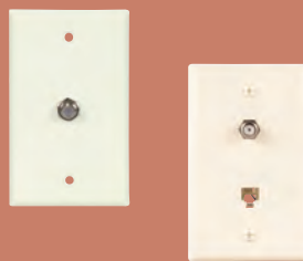
Standard Size Wallplates with Connectors D-13