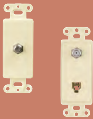
Decorator Inserts with Connectors D-12