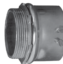
4125S - 4400S