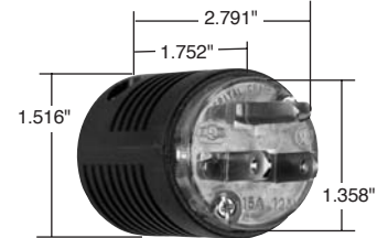
Dimensions for 15 & 20 Amp Plug