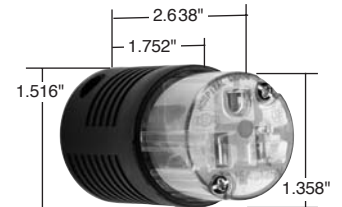
Dimensions for 15 & 20 Amp Connector