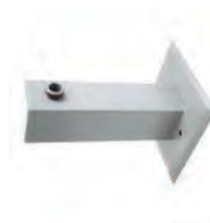
WBR Wall Mount Bracket