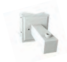
CBR Corner Mount Bracket