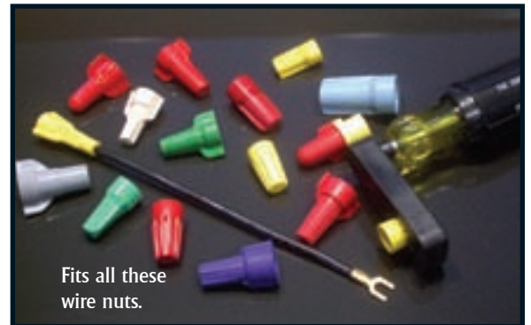
Fits all these wire nuts.

Do you prefer to twist your nuts or spin your nuts? Twisting is slow and can be painful, especially when carpal tunnel sets in. Why not spin your wire nuts with the NUT SPINNER? Much faster and easier, and it really cinches them up.