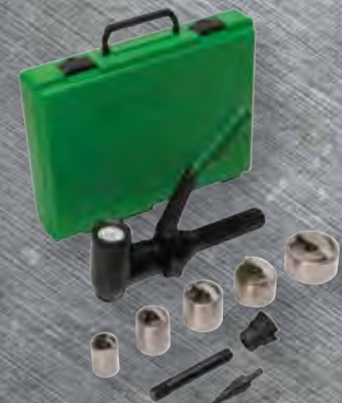
SPEED PUNCH™ KIT (w/Quick Draw 90 Driver)