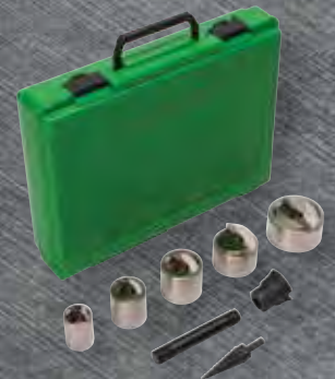
SPEED PUNCH™ KIT (without driver)*

Look for SPEED PUNCH™ products and "Try Me" display at supporting Greenlee distributors.