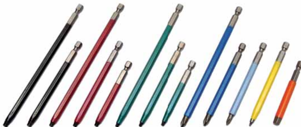
Part #7000 Series