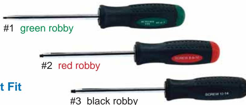
#1 green robbey