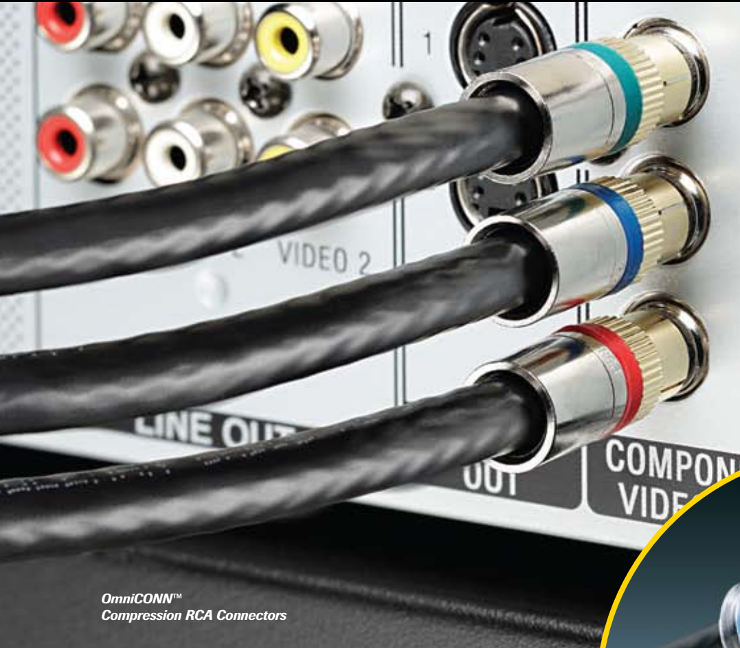
OmniCONN™ Compression RCA Connectors