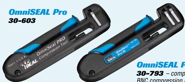
OmniSEAL Pro XL 30-793 – compresses BNC compression connectors