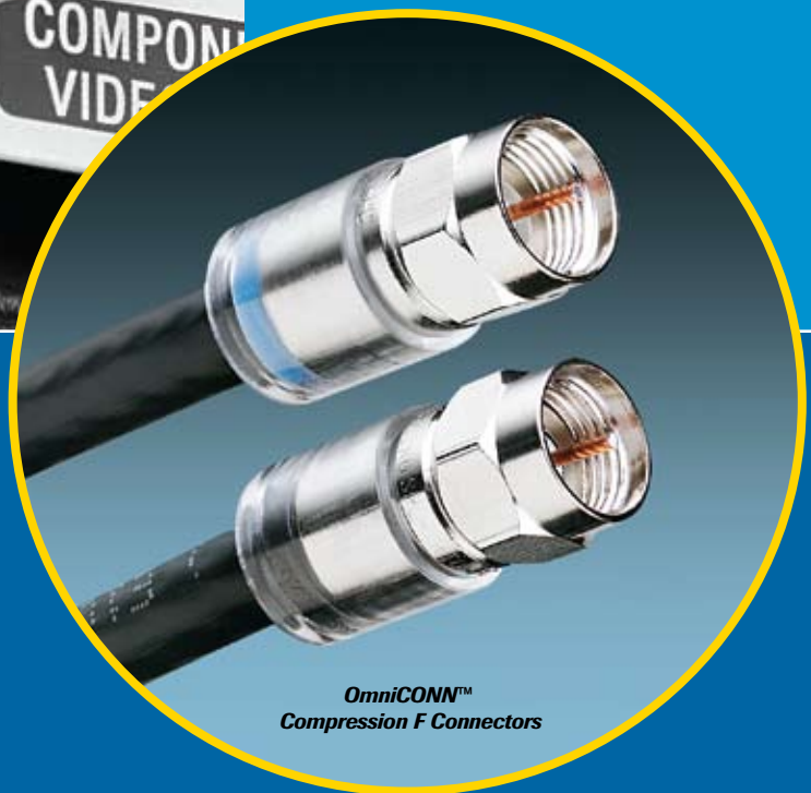
OmniCONN™ Compression F Connectors