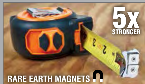
5x STRONGER RARE EARTH MAGNETS