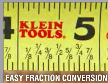
EASY FRACTION CONVERSION