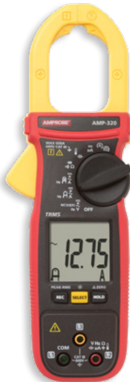
AMP-320 AC/DC Clamp Meter Electrical Motor Maintenance