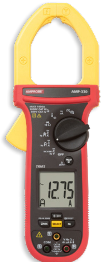
AMP-330 AC/DC 1000 A Clamp Meter Industrial Motor Maintenance