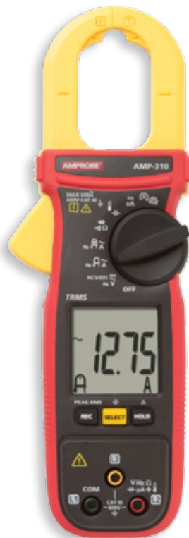
AMP-310 AC Clamp Meter HVAC