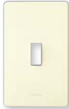
LA Light Almond