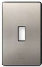
SS Stainless Steel*

*Stainless Steel finish wallplates include black plastic trim/adaptor, visible from side. Match with separate Black (BL) controls.