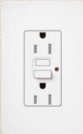
Tamper resistant GFCI receptacle