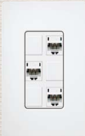
Customizable 6-port frame