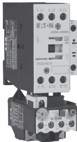
XT Starter with XTOB Thermal OL