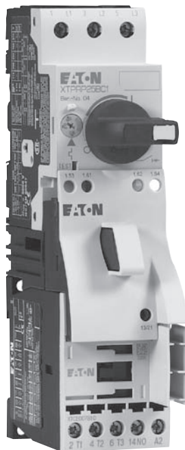
XT Manual Motor Controller