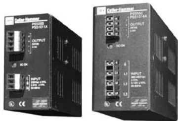
Table 7. PSS Power Supply Selection