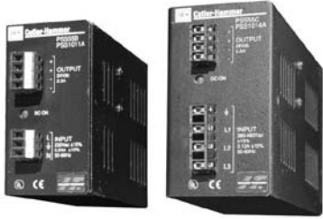
Table 7. PSS Power Supply Selection