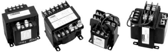
Table 5. Type MTE—Product Selection