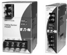
Table 6. PSG Power Supply Selection