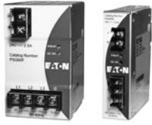
Table 6. PSG Power Supply Selection