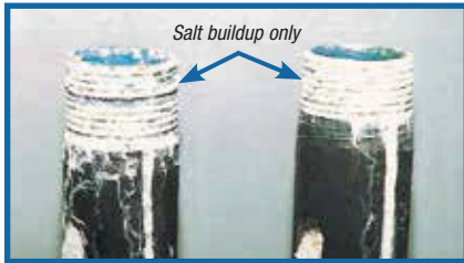
Example of Hot-Dip Galvanized Threads after 42-day salt-fog test

A compelling demonstration of the protection hot-dip galvanizing provides is shown below, using a common corrosive agent, salt, on hot-dip galvanized threads. UL6, the standard for rigid metal conduit, references ASTM B117 for evaluating protective coatings. Below are the results of a salt-fog test using the standard test method ASTM B117.