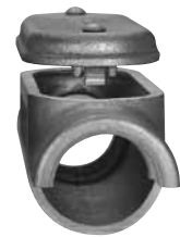
Crouse-Hinds Form 7 (C57, 1-1/2") 26 Cubic Inches Capacity