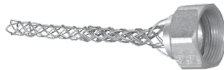
Wire Mesh Strain Relief for Cord Connectors