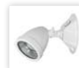
OCR Outdoor (Single and Twin)