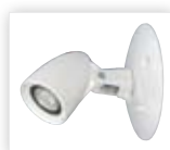
CPR Indoor (Single and Twin)