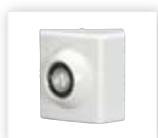
LZR Decorative Remote