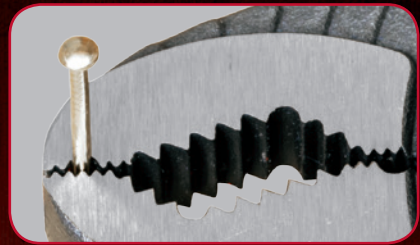
Nail Holding Groove