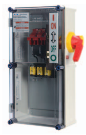
Halyester CUBEFuse Safety Switch with Clear Cover