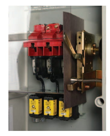
Enhanced Line Shield and Interlock Defeater