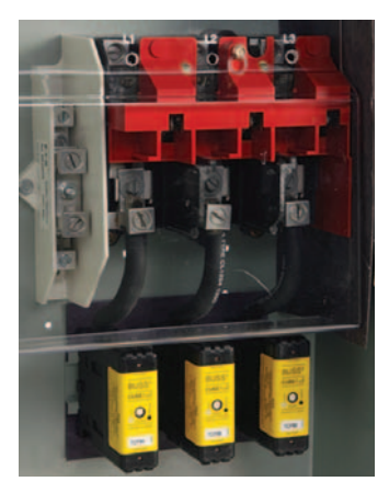
Enhanced Line Shield