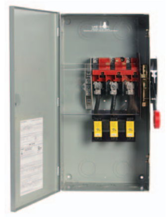
NEMA 1 CUBEFuse Safety Switch