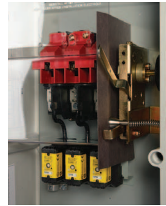
Enhanced Line Shield and Interlock Defeater