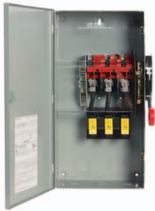
NEMA 1 CUBEFuse Safety Switch