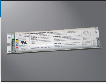
EBP450X / EBP700X