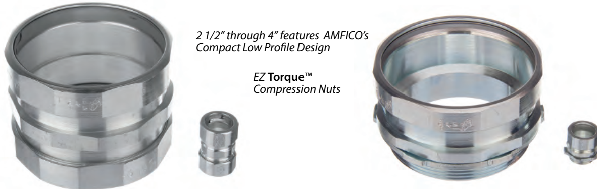
2 1/2" through 4" features AMFICO's Compact Low Profile Design

Available: Solid Alloy Steel Construction, Precision Machined EC Series: Compression Feature: AMFICO EZTorque Compression Nut Zinc Plated, Chromate Finish - Colors available Insulated Throat Bushing Option Available on Connectors*