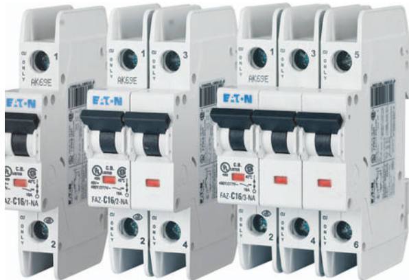
Optimum and Efficient Protection for Every Application