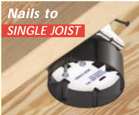
Nails to SINGLE JOIST