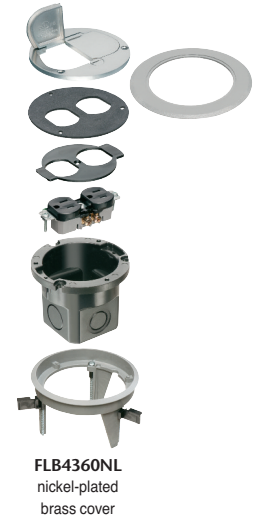
FLB4360NL nickel-plated brass cover