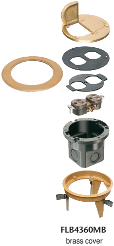
FLB4360MB brass cover

Metal or Non-metallic Covers • FASTEST Installation in Existing Floor