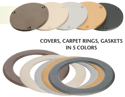
COVERS, CARPET RINGS, GASKETS IN 5 COLORS

DROP IN BOX Kits with BLANK NON-METALLIC COVERS include non-metallic box, round 4" diameter non-metallic cover blank, non-metallic gasket support plate, gasket, carpet ring, UL Listed 15 amp TR duplex receptacle, mounting bracket, NM94 and NM95 cable connectors, (3) #8 x 1/2" flathead screws and (1) #6 x 1/2" screw.