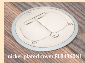
nickel-plated cover FLB4360NL