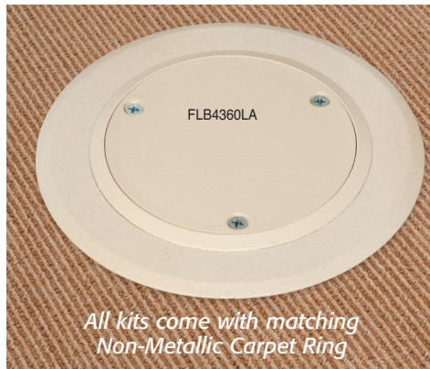
All kits come with matching Non-Metallic Carpet Ring

DROPIN kits are also available with NON-METALLIC Blank Covers. They're perfect for covering unused receptacles. To use the receptacle simply remove the blank cover.