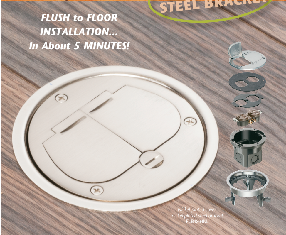
Nickel-plated cover, nickel plated steel bracket FLB4364NL

FLUSH to FLOOR INSTALLATION... In About 5 MINUTES!