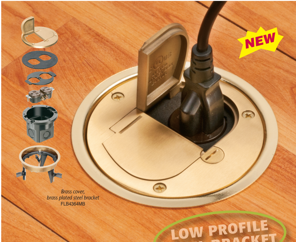
Brass cover, brass plated steel bracket FLB4364MB

Fastest, FLUSH installation • Low Profile Metal Covers, Steel Bracket