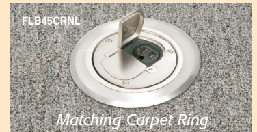
Matching Carpet Ring