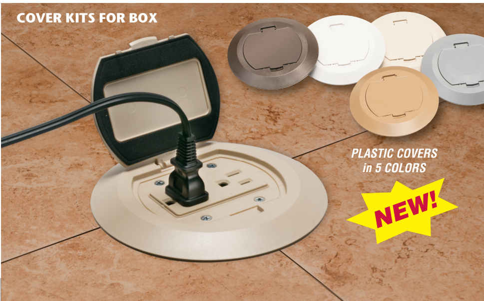
Box without mud cover