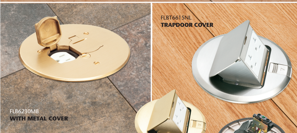
FLB6230MB WITH METAL COVER