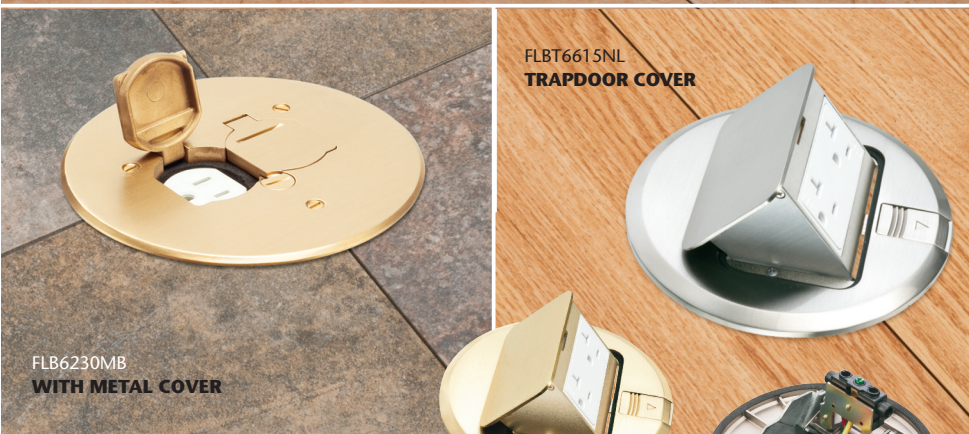
FLBT6615NL TRAPDOOR COVER