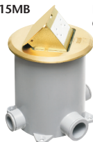
FLBT6615MB open on FLBC4500 concrete box