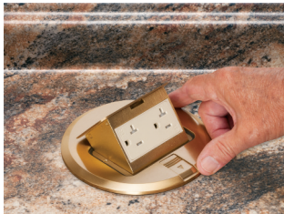
6 Rotate box/cover assembly into position, lining it up parallel with backsplash, if installing in a countertop.