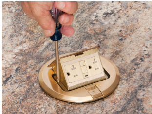
4 Install trapdoor coverplate to box using the two #6-32 screws provided. Round cover hides miscut openings