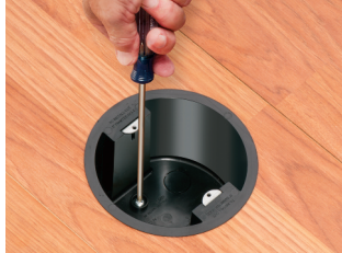
2 Secure box by tightening two #10 screws inside box.