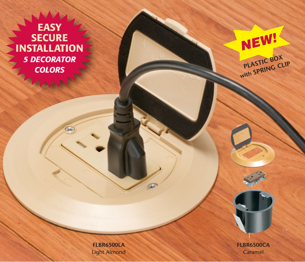
FLBR6500LA Light Almond