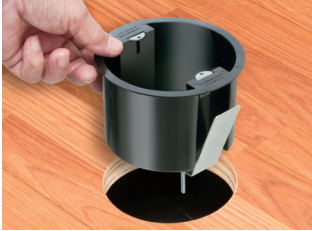
1 Cut a 5" diameter opening. Insert box.

Installs just like FLBR6500 series in a FLOOR