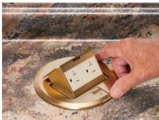
6 Rotate box/cover assembly into position, lining it up parallel with backsplash, if installing in a countertop.