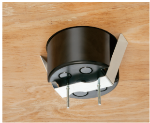
Underside of subfloor

3 Rotate box to desired orientation. Tighten #10-32 screws to pull box securely against the underside of subfloor.