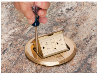
4 Install trapdoor coverplate to box using the two #6-32 screws provided. Round cover hides miscut openings