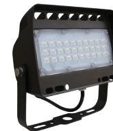
50W - yoke