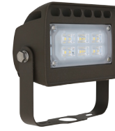
12W - yoke