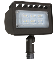
12W - knuckle