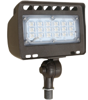
30W - knuckle