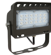
30W - yoke