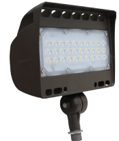
50W - knuckle