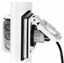
Receptacle Cover mounted on Switch Box with FSK-SBA Adapter/Gasket