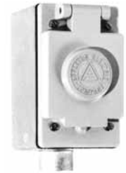
Single Cover on FS Box.