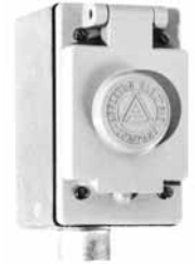
Single Cover on FS Box.