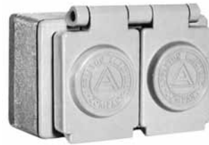
Duplex Cover on FS Box.

Typical application with NEMA configuration receptacle and plug, mounted on an FS box. Gasket seals around plug, keeping out moisture and dirt. Spring door closes automatically when plug is withdrawn to protect receptacle.