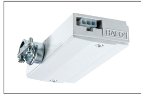
HU109 Splice Box