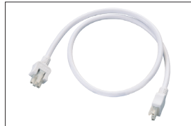
HU1010 12" Daisy Chain Connector