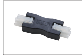
HU107 1-1/2" Male-to-Male Connector

Finish: P = White; MB = Matte Black Example: HU101P = 3" Daisy Chain Connector, White