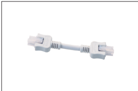
HU101 3" Daisy Chain Connector