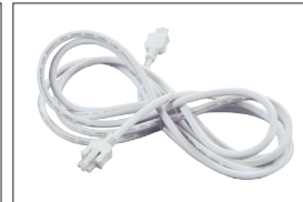
HU1011 18" Daisy Chain Connector