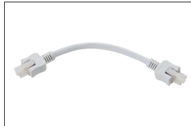
HU102 6" Daisy Chain Connector