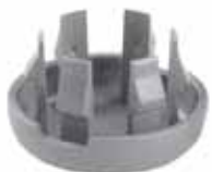
Part # KOK Series