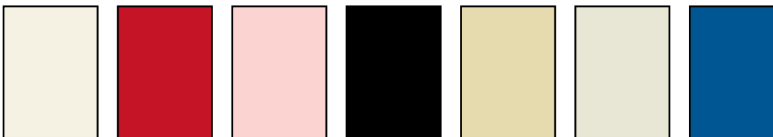
Primer Red Pink Flat Black Ivory Light Almond Blue

To order custom metal wall plates, see Pages P-40 – P-42. For additional colors consult factory.