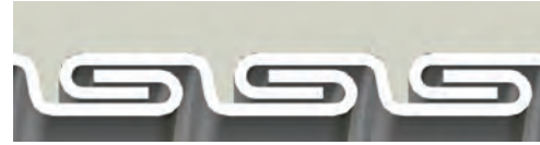
Interlocked Design 1-1/2" through 4" with no bonding wire