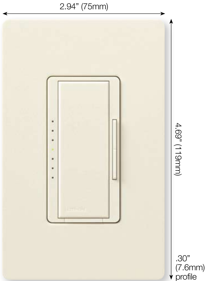
Shown actual size: Maestro® preset digital fade dimmer and 1-gang Satin Colors® wallplate in biscuit (BI)