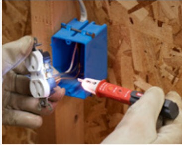
Test wires for AC voltage