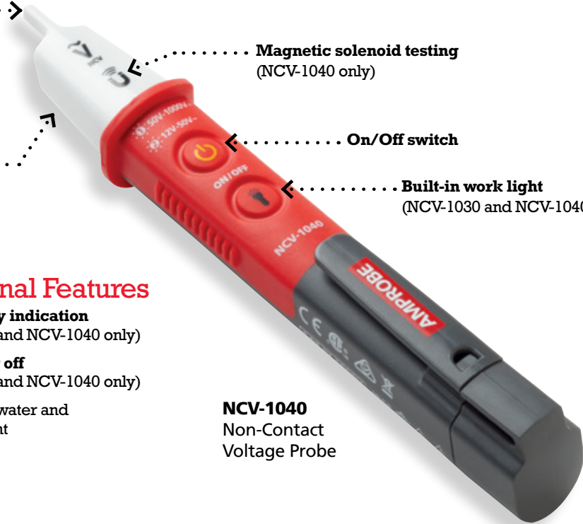
NCV-1040 Non-Contact Voltage Probe