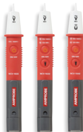
NCV-1000 Series Non-Contact Voltage Probe

The Amprobe NCV-1000 Non-Contact Voltage (NCV) tester series provides maximum safety and convenience for detecting AC voltage without interrupting electrical systems. Designed to conveniently fit in your shirt pocket, the NCV-1000 series performs in indoor and outdoor settings. Safety tested to the highest category measurement, CAT IV 1000 V, as well as IP65 water and dust resistant, the NCV-1000 series is fit for the toughest industrial applications.