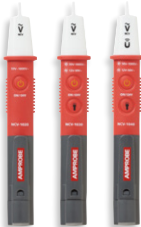
NCV-1000 Series Non-Contact Voltage Probe

The Amprobe NCV-1000 Non-Contact Voltage (NCV) tester series provides maximum safety and convenience for detecting AC voltage without interrupting electrical systems. Designed to conveniently fit in your shirt pocket, the NCV-1000 series performs in indoor and outdoor settings. Safety tested to the highest category measurement, CAT IV 1000 V, as well as IP65 water and dust resistant, the NCV-1000 series is fit for the toughest industrial applications.