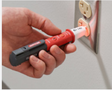
Test wall sockets for AC voltage