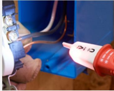
Built-in worklight (NCV-1030, NCV-1040)