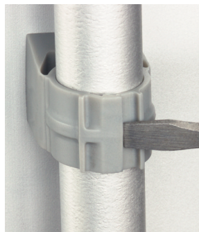
Removable Use screwdriver to lift tab.

Fast and easy to install, one-piece, non-metallic QuickLATCH™ mounts to walls, metal strut and studs, and threaded rod up to 1/4-20...works with Arlington's Strut Clip™ too. Strut Clip holds pipe hangers securely on strut.