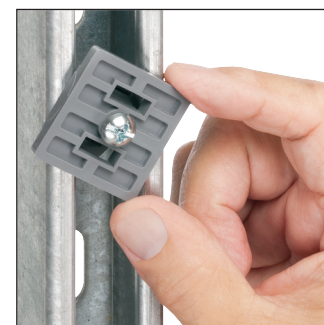
Our QuickLATCH™ Pipe Hanger installs on Strut Clip™