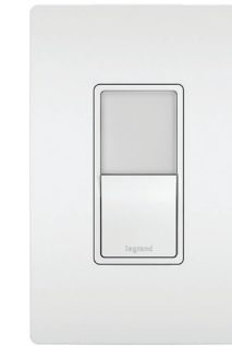
NIGHT LIGHT WITH SINGLE POLE/ 3-WAY SWITCH