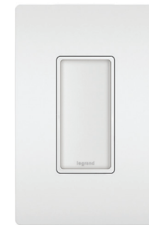
FULL NIGHT LIGHT WITH SENSOR