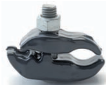
Parallel Beam Clamp