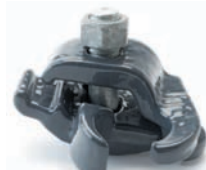
Edge Beam Clamp