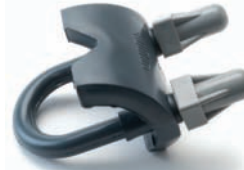
Right Angle Beam Clamp