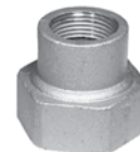
Bell Reducing Coupling