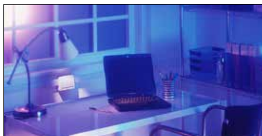
Eclipse Raceways shown in typical installations.