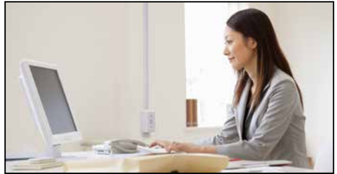
Eclipse PN05 Series Raceway shown in an office installation.

Eclipse PN03, PN05, and PN10 Series Raceways are specifically designed for the workstation. They accept Ortronics® Series II and TracJack® modules, Pass & Seymour® Activate Series inserts, and Wiremold Open System communication modules.