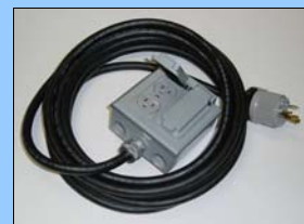
Contractor Convenience Cord Model M10325

Designed for generators up to 7500 watts, this heavy duty, all rubber cord provides a convenient way to use tools or appliances on a jobsite or while camping. Instead of juggling with multiple extension cords, connect this 25 foot cord to the L5-30 receptacle on your generator. Then connect your tools or appliances to the weatherproof box. For 120 volt use only.